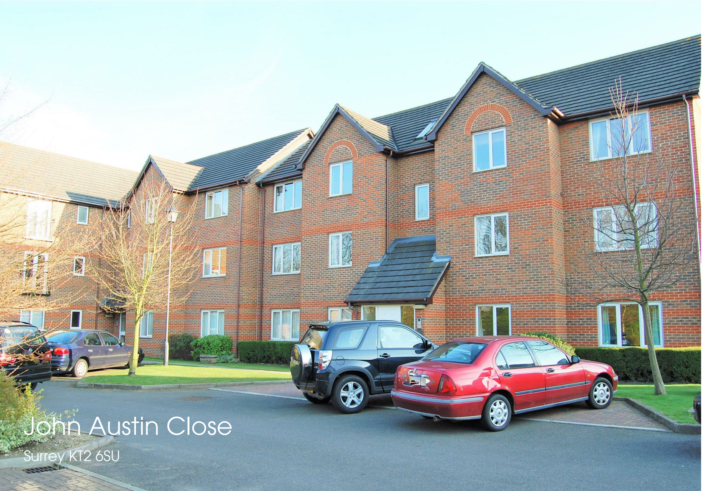
John Austin Close Surrey KT2 6SU